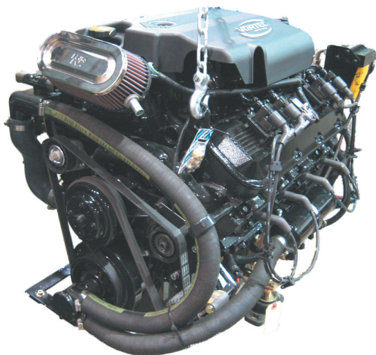
8.1L Bobtail Pictured (part #041004)

Valve Covers Spark Plugs Plug Wires High Gloss Paint (non-corrosive)